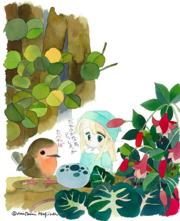
The Silverday Fairytale / Mutsumi Hagiwa © Mutsumi Hagiwa