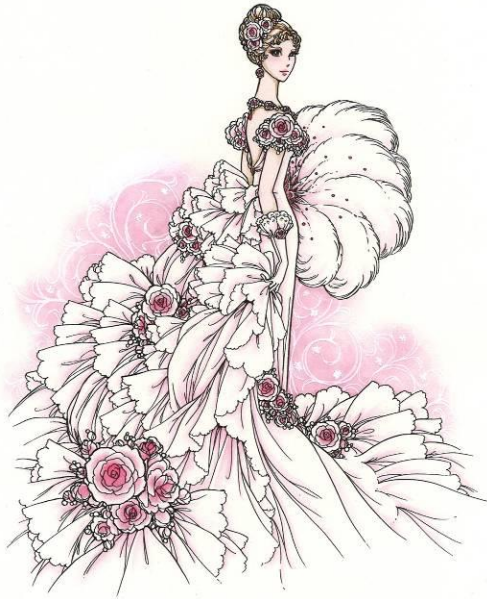
Elisabeth / Hideko Mizuno © Hideko Mizuno

For the usage of the following images for your media, please contact the staffs in charge above. We will provide a bigger size of each image upon your request.