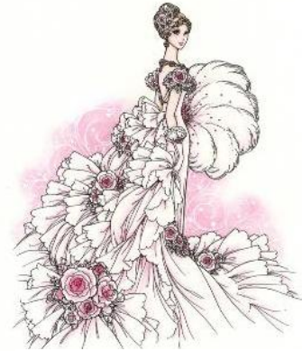
Elisabeth

Manga, which is a kind of lingua franca, is now a global phenomenon connecting with cultures beyond Japan. Particularly, shōjo manga or the girls comics genre is interesting owing to its history of more than a half century which has been inspiring women to create, while previously around the world, many comics cultures have targeted boys, not girls.