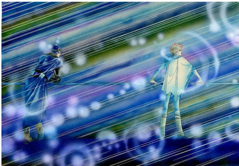
A – A' / Moto Hagio