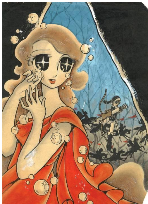
Silver petals / Hideko Mizuno © Hideko Mizuno