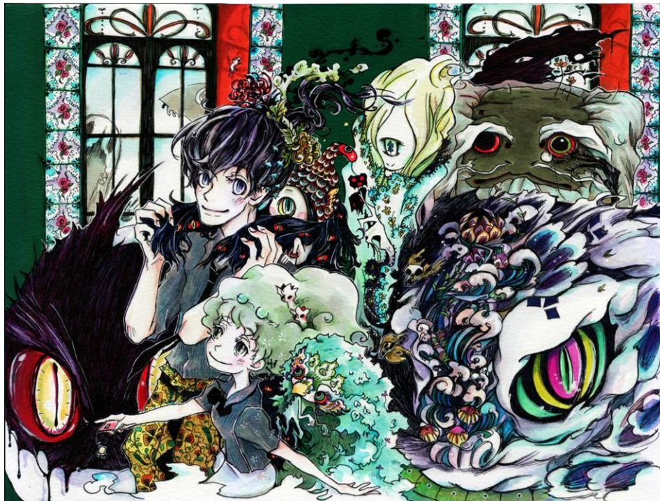
Clairvoyance / FSc © FSc